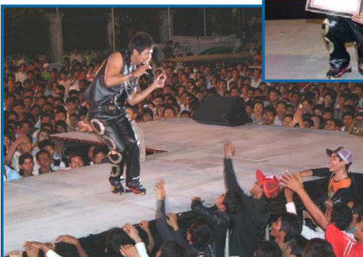
More than 200 children with disabilities, joined in the festivities at the FURADA Concert.

A landmark initiative during this period was the collaboration of coalition NGOs, to organise an awareness and fund raising event with an activities and products exhibition and concert show at the Olympic Stadium, Phnom Penh. Support was provided by a number of popular Cambodian singers and comedians and others who gave wonderful performances as well as expressing their views on the rights of persons with disabilities. The concert was a complete success and attracted an audience of more than 15,000 which is seen as a clear indication of an increasing public awareness of disability issues.