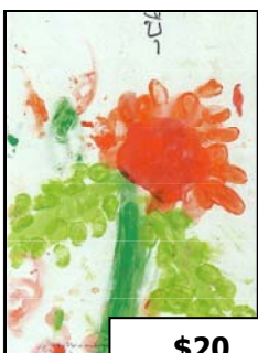
$20 Gift Card