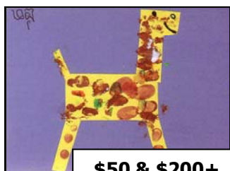
$50 & $200+ Gift Card