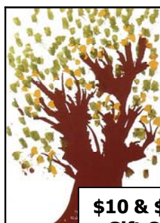
$10 & $200 Gift Card