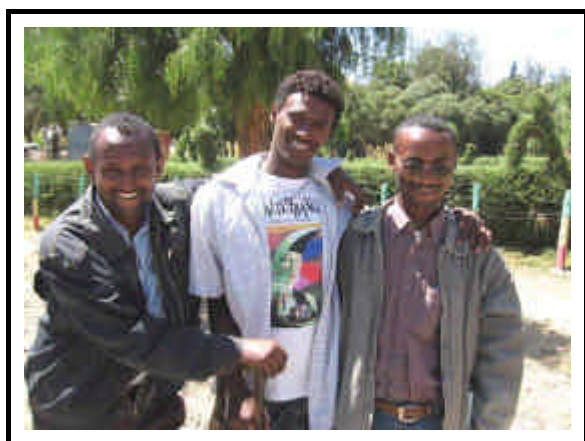
Two trainers at Mekelle Vocational Training Centre meet with an ex-student (centre) now selling wares to Tourists at Axum