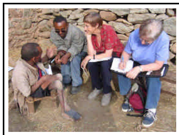
Enlightening discussions with a disabled farmer in Central Tigray