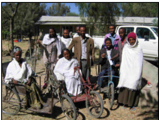
Abyssinia Cooperative group

During our 2005 situational assessment, it was found that many disabled persons; children, women and men, do not have a permanent home and this was listed by many as being a major concern.