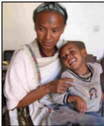
Woman and Cerebral Palsy son at Bolsa

Tigray has a high number of persons with disabilities, although no accurate figures are available. The last known figure of 90,742, taken from the Statistical Report of 1994 Population and Housing Census of Ethiopia, however it is considered to be much less than the true figures and based on WHO criteria of 10%,