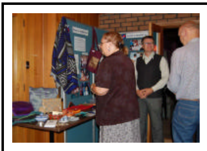
The Friends of interPART Trading Table was also a huge success.