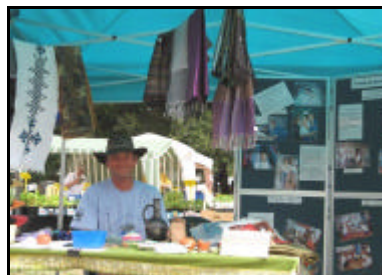
Macclesfield Strawberry Fete

Our sincerest thanks are extended to all involved with the event and to those who gave so warm heartedly ~ see photo gallery on page 8.